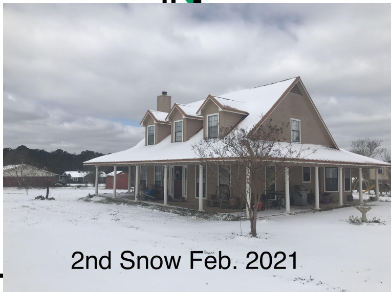
2nd Snow Feb. 2021